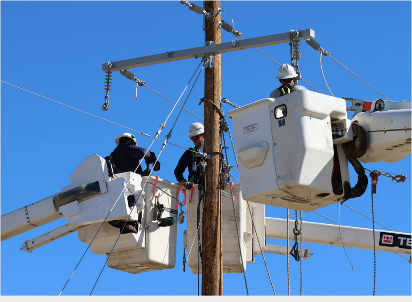
Crews from Casper and Riverton worked on the last day of the project in Powder River.

The majority of the work was done during three planned outages. As crews worked, they were able to cut over and move services to new sections of line. New services were added as needed and old, unused services were retired and removed.