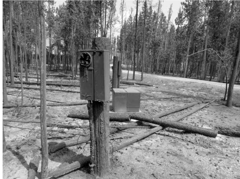
Meter bases, meters and transformers were damaged from the Lava Mountain Fire.

and patience during this difficult time. And finally thank you, to the line crew who helped others leave the areas safely.