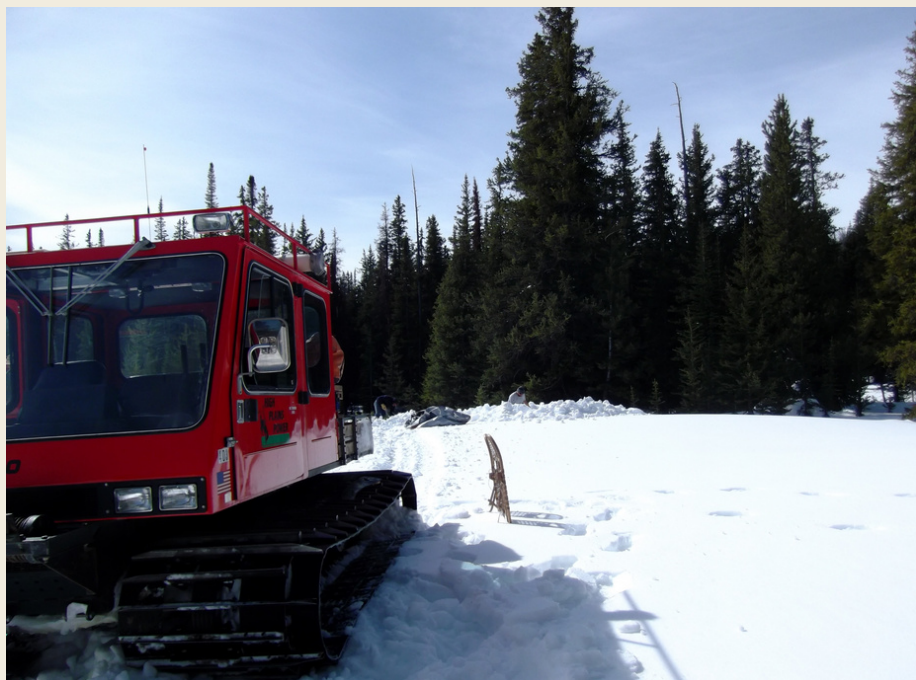
Ever wonder how our crews replace poles or restore outages in deep snow? They use a snowcat to get where they need to go!