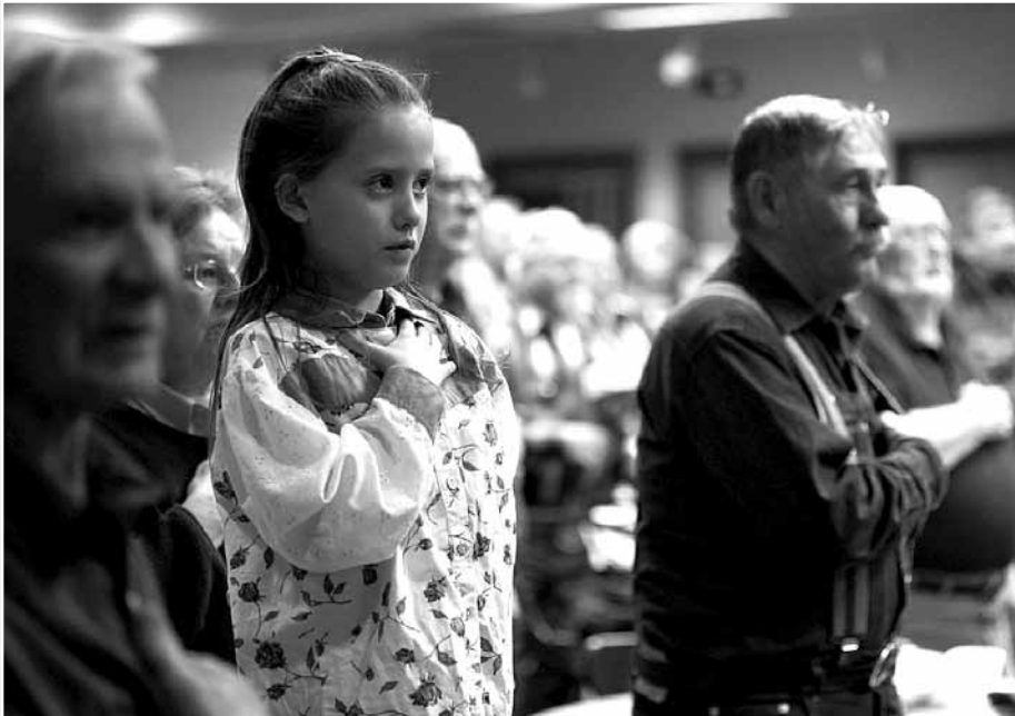
Reciting the Pledge of Allegiance before the Annual Meeting.