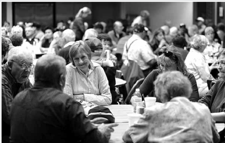
A large crowd enjoyed the meal and the meeting.