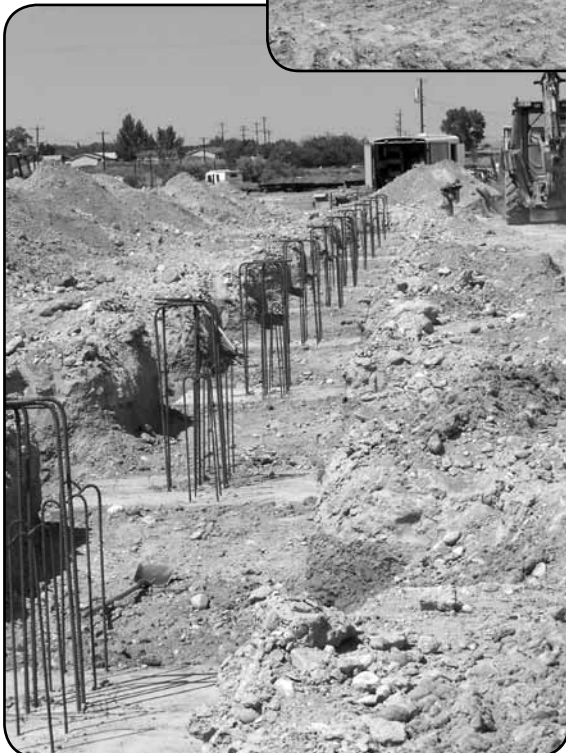
Footings for the warehouse and shop