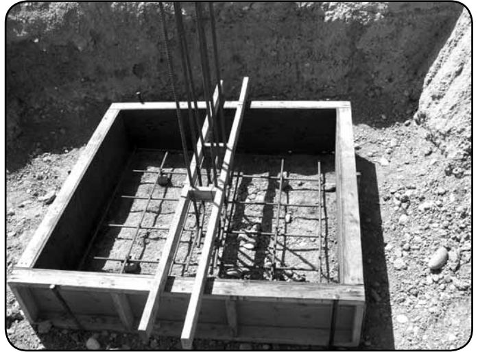
These footings are approximately 8' x 8' x 2'

Main entrance for the future administration building.