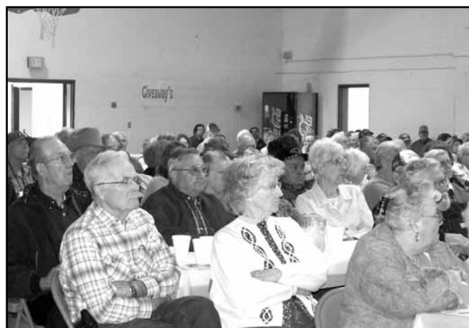
The membership listened intently to the business meeting.